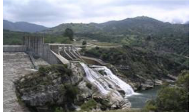
Gibraltar Reservoir is part of Santa Barbara’s water supply network.